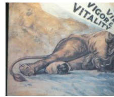
From 1905 to 1925 Dr Pepper was crowned King of Beverages.