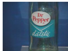
The first Diet Dr Pepper was sold in 1963.