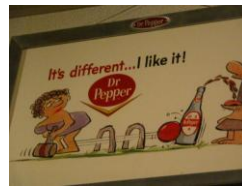
This 1960's chevron logo got help from Johnny Hart, creator of B.C. comic strip.