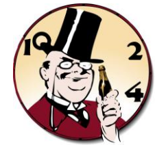
This old country doc called on people to drink Dr Pepper from 1926-1938.