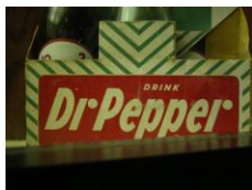
This 1950's logo is the first time Dr appeared without the period.

Circle these Dr Pepper Logos after finding them in the museum.