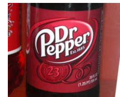
This logo can be seen on bottles and advertising today.