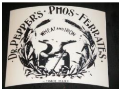
This 1891 Logo tried to express Dr Pepper's health benefits.