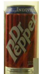
This 1990's can used a slash logo and was a modernistic take of the 1980's slant