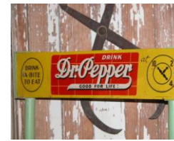
This 1926 logo and slogan talks about 3 good times to drink Dr Pepper.